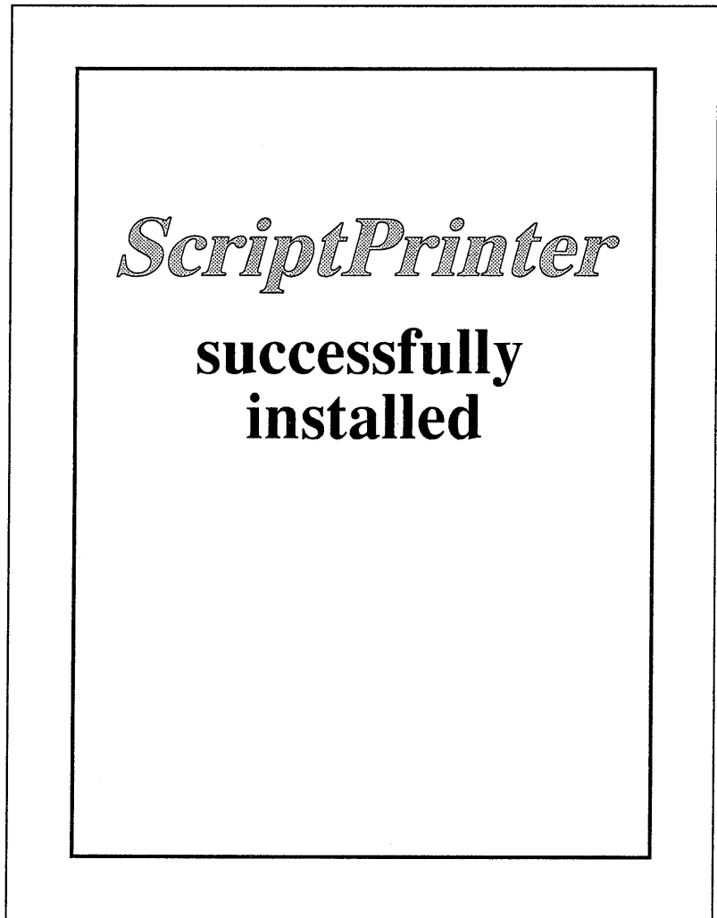
Figure C-4: Printed IVP Output—POSTSCRIPT Data Page