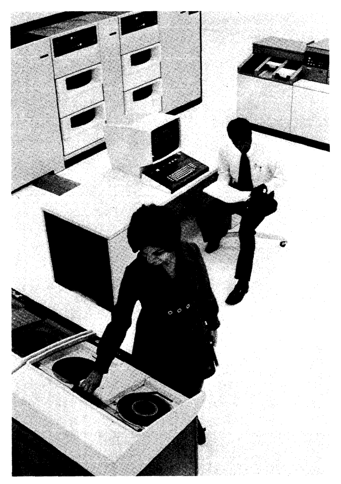
High-speed peripheral equipment for the Model 125 is currently limited to the 3330 Series Disk Storage drives (left rear), which provide up to 400 million bytes of on-line storage, and the 3410/3411 Magnetic Tape Units (left foreground), which provide data rates of up to 80,000 bytes/second.

Segment tables and page tables maintained by the operating system indicate whether the needed page is already in real storage. If so, execution of the program continues. If the page is not present in real storage, then paging takes \sum