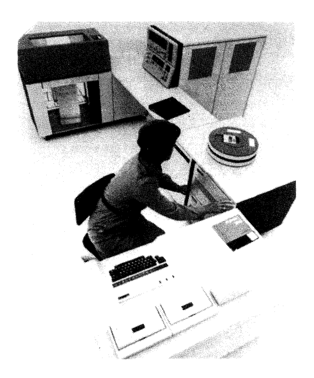
IBM's first totally cardless System/3 is the new Model 8. It is designed for batch processing and convenient addition of communications, thanks to the first Integrated Communications Adapter available on a System/3. In the foreground, the operator is seated at a directly attached 3741 Data Station, whose interchangeable diskettes substitute for card I/O. A typical system as shown rents for about $1.849 or sells for $72,075.