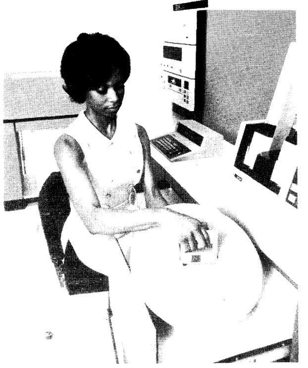
In the System/3 Model 10, the compact 5444 Disk Storage Drive and its removable single-disk cartridge are conveniently housed in a drawer beneath the 5424 Multi-Function Card Unit.